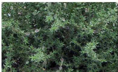
Russian Thistle emerges earlier but can interfere throughout the entire growing season.