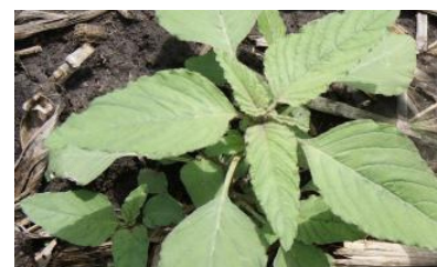
While later emerging, Redroot Pigweed can be problematic to chickpeas.